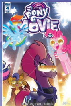
COVER B art by Tony Fleecs