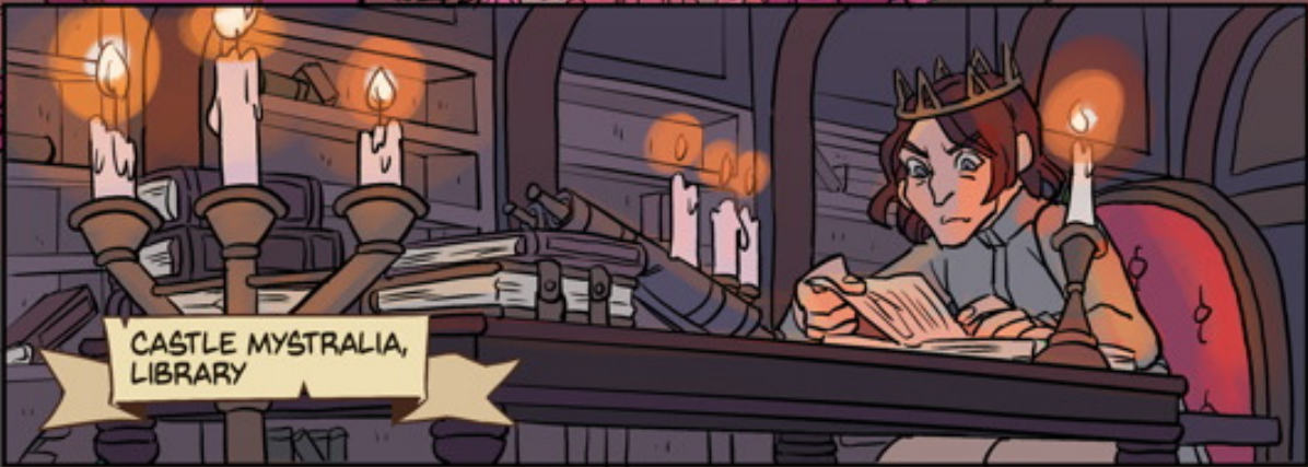
CASTLE MYSTRALIA, LIBRARY