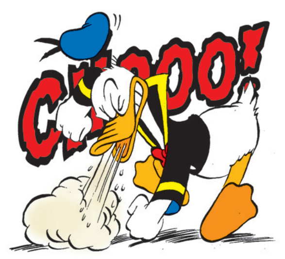
STORY 1 The Big Sneeze from Dutch Donald Duck Vakantiebok 1980 (First USA Publication)