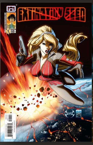
COVER B REGULAR 50% BENITEZ - NOCERA