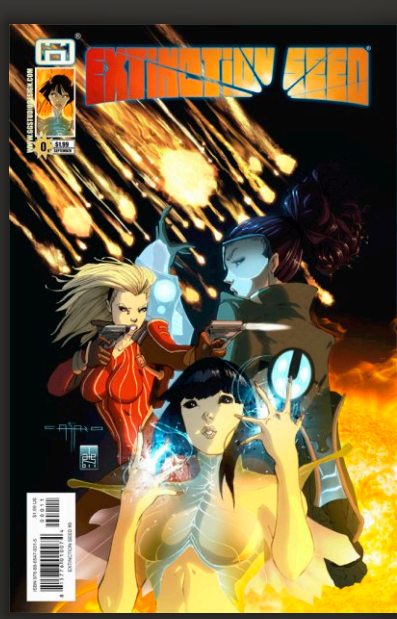
COVER B REGULAR 50% CAFARO - NOCERA