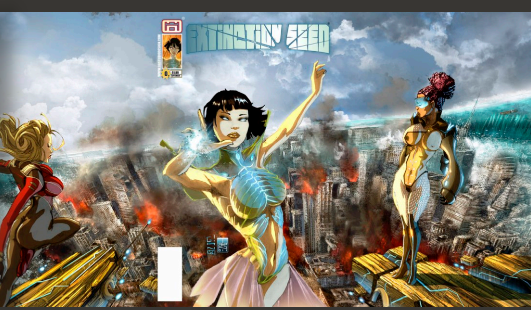
COVER D LIMITED 400 EXTENDED GIANO - NOCERA