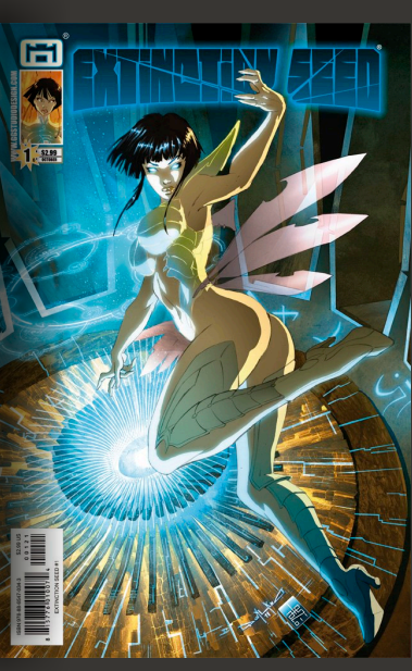
COVER C INCENTIVE QUALANO - NOCERA