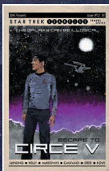
Retailer Incentive Cover Art by J.J. Lendl