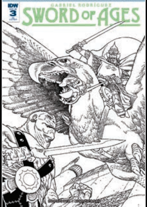
RETAILER INCENTIVE COVER ART BY GABRIEL RODRÍGUEZ