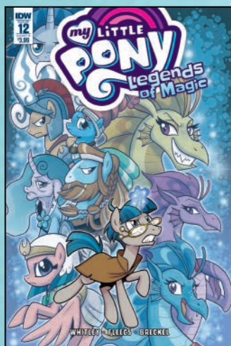
SUBSCRIPTION COVER art by Brenda Hickey