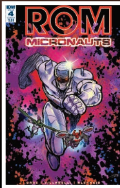
COVER B (A) GIANNIS MILONOYIANNIS