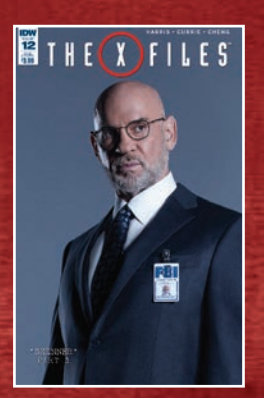
SUBSCRIPTION COVER Photo Cover