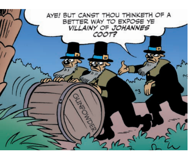
STORY 3 Suds In Your Eye from Dutch Donald Duck 10/1966 (First USA Publication)