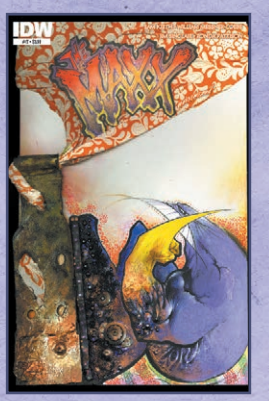
STANDARD COVER Artwork by Sam Kieth