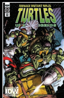
Convention Exclusive Cover Art by Frank Fosco Colors by Courtland Brugger