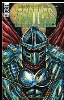
Retailer Incentive Cover Art by Kevin Eastman