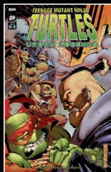
Retailer Incentive Cover Art by Nikos Koutsis