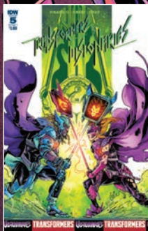
COVER A art: FICO OSSIO