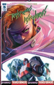
COVER B art: SARA PITRE-DUROCHER