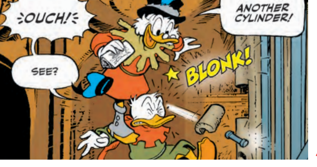
STORY 1 The Hansa Hazard from Finnish Aku Ankka 24/2011 (First USA Publication)