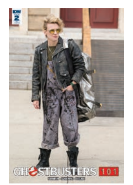
RETAILER INCENTIVE WRAPAROUND PHOTO COVER