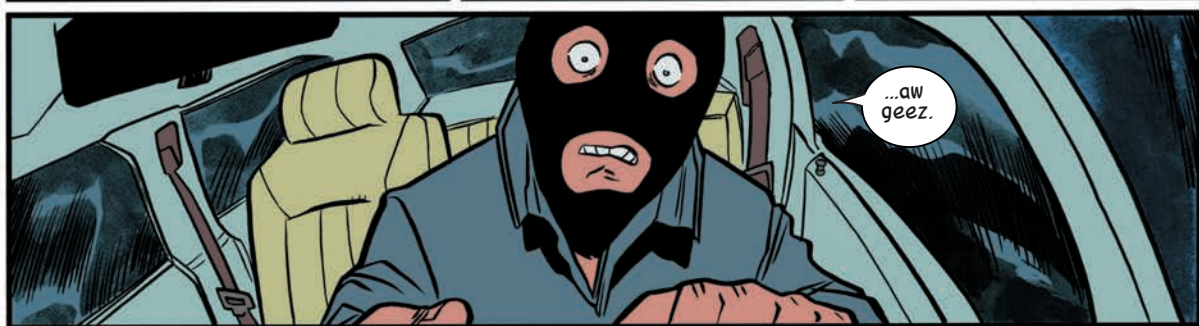
These are the bank robbers from the first time Squirrel Girl saved a bank! They're back! And they're still robbing banks! Wow, I'd really hoped they'd have worked towards positive change in their own lives but hah hah hah guess not!