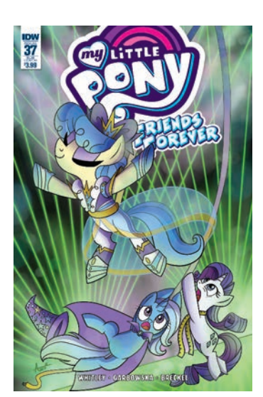
SUBSCRIPTION COVER art by Agnes Garbowska