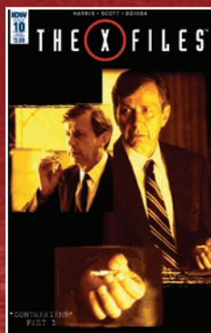
SUBSCRIPTION COVER Photo Cover