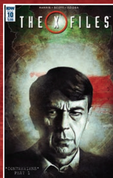
REGULAR COVER Art by Menton 3