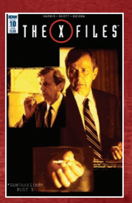
SUBSCRIPTION COVER Photo Cover