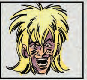
LOVE SAVAGE Prince, war criminal, former gigolo, fugitive (active)