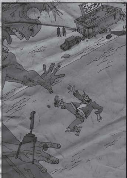
Pictured: Dramatization of alleged events.