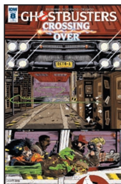
RETAILER INCENTIVE COVER ART BY LUCA PIZZARI