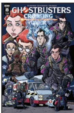
COVER B ART BY TIM LATTIE