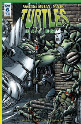
Cover A Art by Frank Fosco Colors by Courtland Bruggar