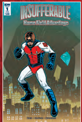
SUBSCRIPTION COVER Artwork by NOLAN WOODARD