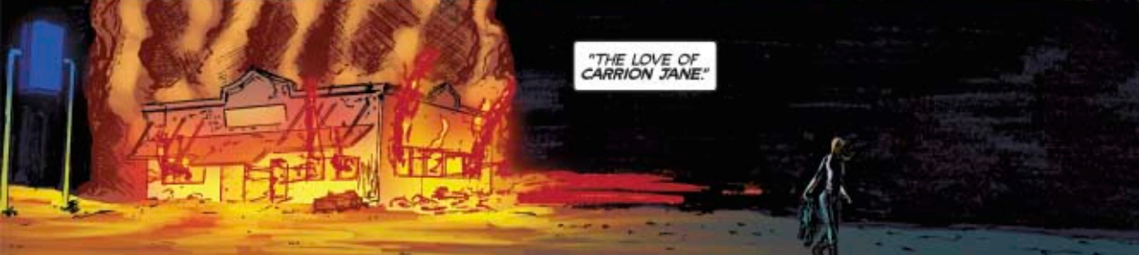
"THE LOVE OF CARRION JANE"