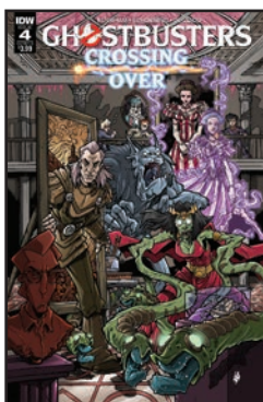
COVER B ART BY TIM LATTIE