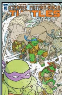
Retailer Incentive Cover Art by Ulises Farinas