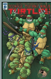
Tri-State Comic Con Exclusive Cover Art by Billy Tucci