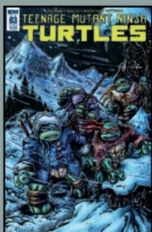
Cover B Art by Kevin Eastman Colors by Tomi Varga