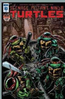
Denver Comic Con Exclusive Cover Art by Kevin Eastman Colors by Tomi Varga