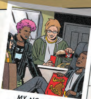
MY NEW FRIENDS