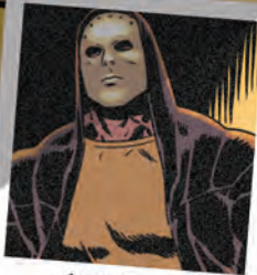
SUPER POWERED HATEMONGER