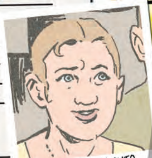
GIRL WHO TURNS INTO A DRAGON

First I'm going to ice my face. Then I'm trackdown whoever's responsible for this and teach them a lesson.