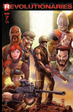
SUBSCRIPTION COVER A