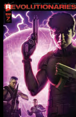
RETAILER INCENTIVE COVER