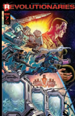
SUBSCRIPTION COVER B