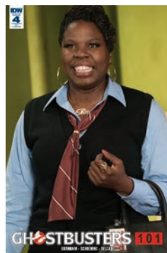
RETAILER INCENTIVE WRAPAROUND PHOTO COVER