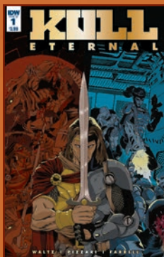
REGULAR COVER Art by Luca Pizzari