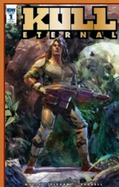
RETAILER INCENTIVE A Art by Xermanico