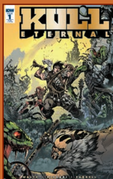
RETAILER INCENTIVE B Art by Jheremy Raapack Colors by Jay Fotos