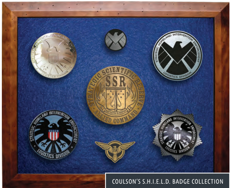
COULSON'S S.H.I.E.L.D. BADGE COLLECTION