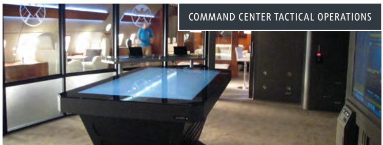
COMMAND CENTER TACTICAL OPERATIONS

Fitz-Simmons' Lab/Cargo Bay: A state-of-the-art research facility within the Bus's cargo bay, Leo Fitz and Jemma Simmons' lab contains equipment needed for on-the-fly biological and mechanical engineering and research. At the lab's center is a supercomputer-powered holotable allowing the interactive inspection, documentation, and analysis of a variety of objects. Upon contamination by a highly volatile or contagious foreign body, the lab can be quarantined from the rest of the aircraft. Thanks to a retrofit from Fitz, the cargo bay can project and display an echo chamber to holographically recreate investigation scenes for life-scale inspection. The cargo bay can house two terrestrial vehicles—including one of Coulson's old S.H.I.E.L.D. collectables, a 1962 Corvette he affectionately named "Lola" (Levitating Over Land Automobile). It has also been used to depart the plane mid-flight via high-risk parachute free falls. ☼