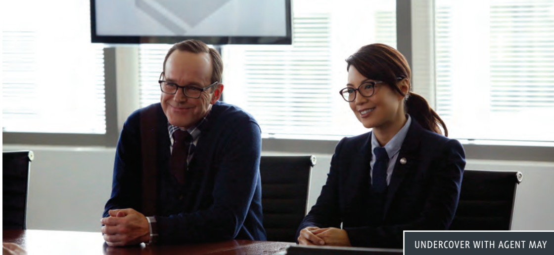
UNDERCOVER WITH AGENT MAY

Unsure of Skye's loyalty, Coulson later investigated her mysterious past. With May, he tracked down former S.H.I.E.L.D. Agent Richard Lumley, who informed them that Skye had been found years before as an infant in a Chinese village after its destruction.