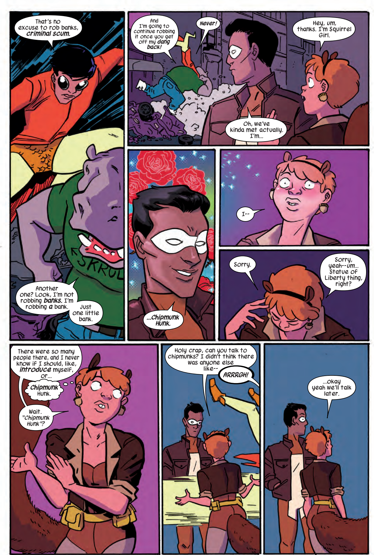
Plus a lot of the other heroes don't really talk as much as I do. I dunno. I don't want to make it weird for them, but then I worry it's weird to not introduce myseif, you know?