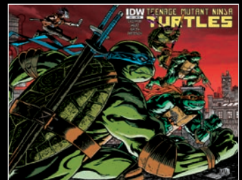
Cover RI Art by Tim Doyle