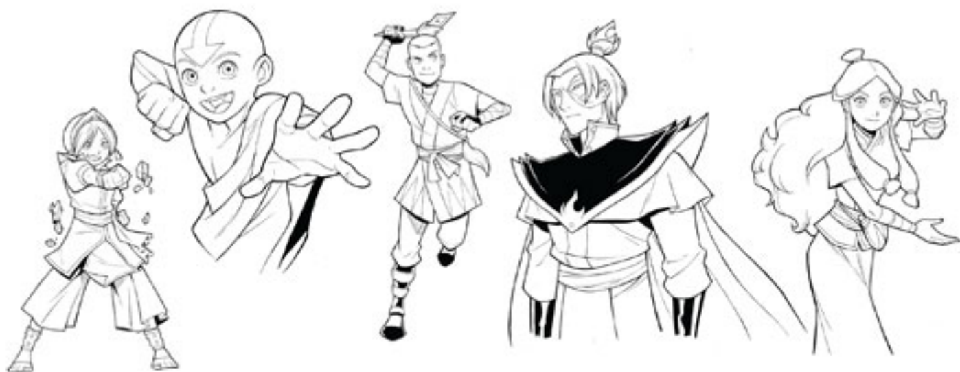
We sent several cover ideas for each part of The Promise . It was very challenging to fit all five characters on each cover.