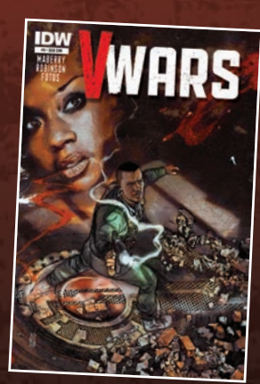
SUBSCRIPTION COVER artwork by Marco Turini