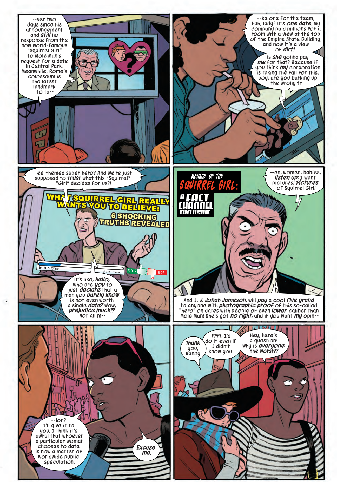
If you want to know what J. Jonah Jameson's business cards say, they have his name at the top in a big font, then "Former Publisher: Daily Bugle, Former Mayor: NYC" in an even bigger font, then just the words "PIX PLZ"" in the biggest font of all.