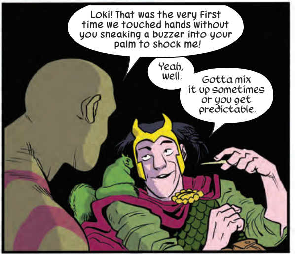
As the old saying goes, when all you have is the ability to summon hand buzzers on demand, all your problems start to look like large, open, and invitingly unbuzzed hands.