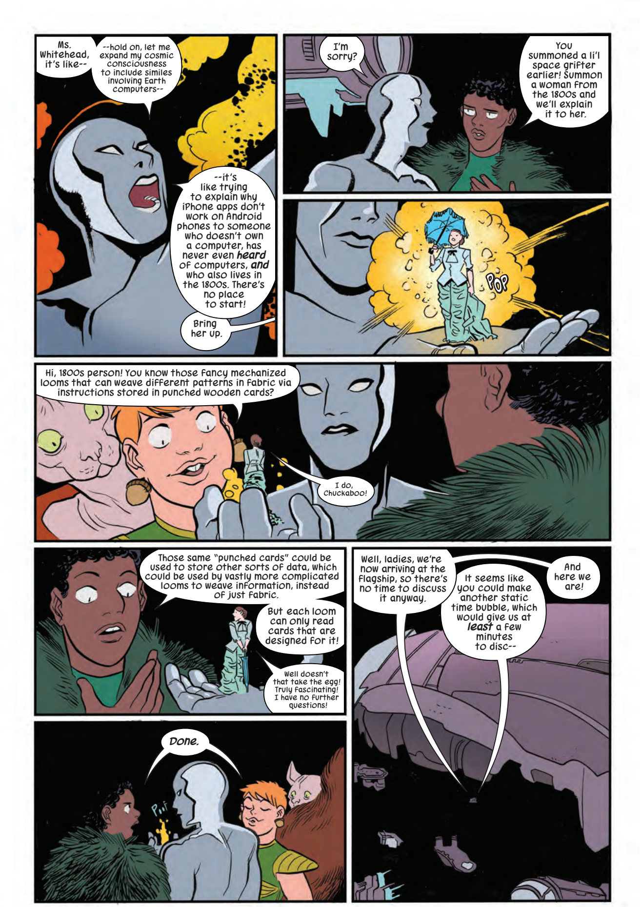
Cut for space is a bit where Nancy and Doreen explain to the Silver Surfer how that simile doesn't even work, because of emulators that allow you to run programs that were designed for certain hardware and instruction sets on other hardware and instruction sets, during which the Silver Surfer nods and smiles very politely.