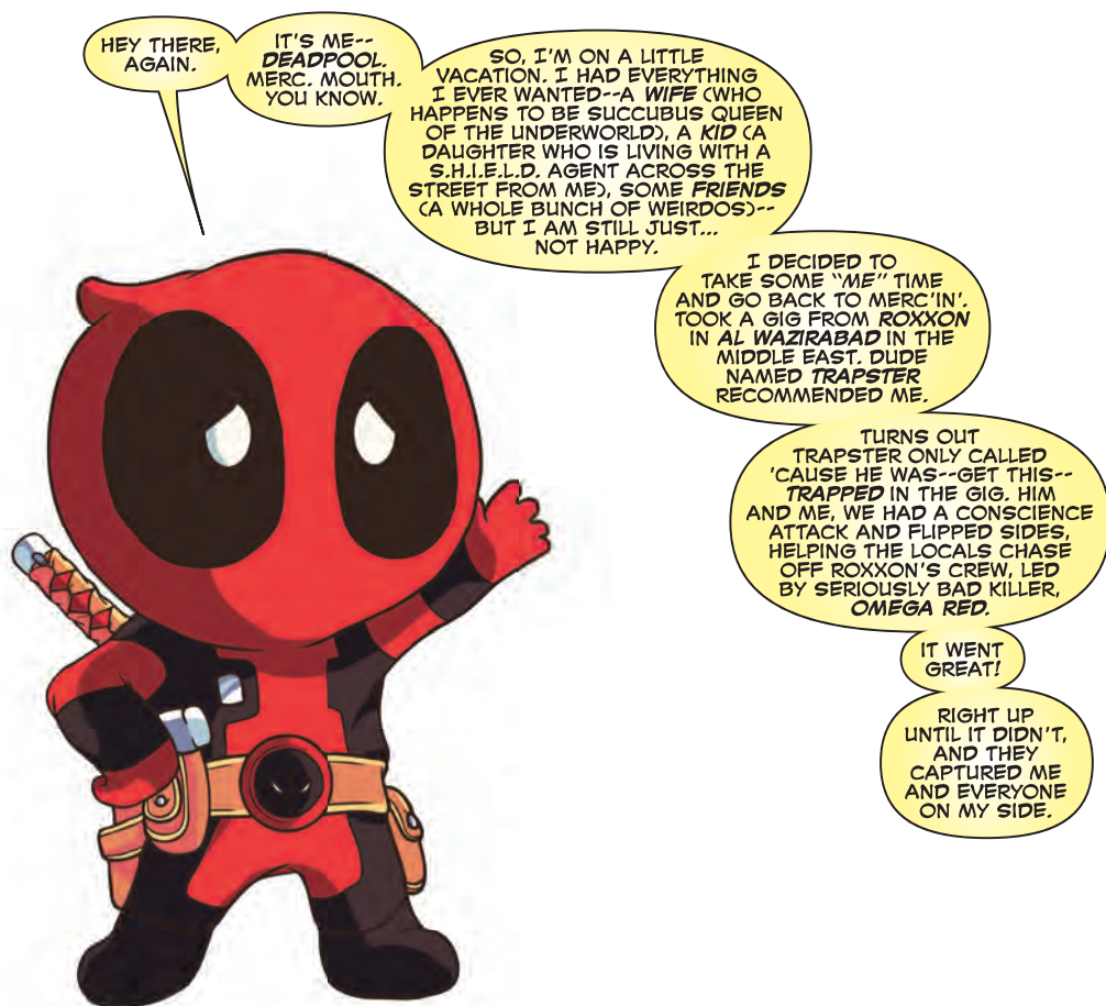
L'I'L ZENPOOL ART BY IRENE Y. LEE