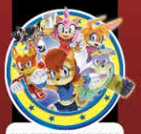
THE FREEDOM FIGHTERS SALLY, ANTOINE, NICOLE, AMY, BUNNIE & ROTOR