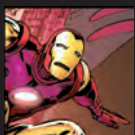
Iron Man (James Rhodes)