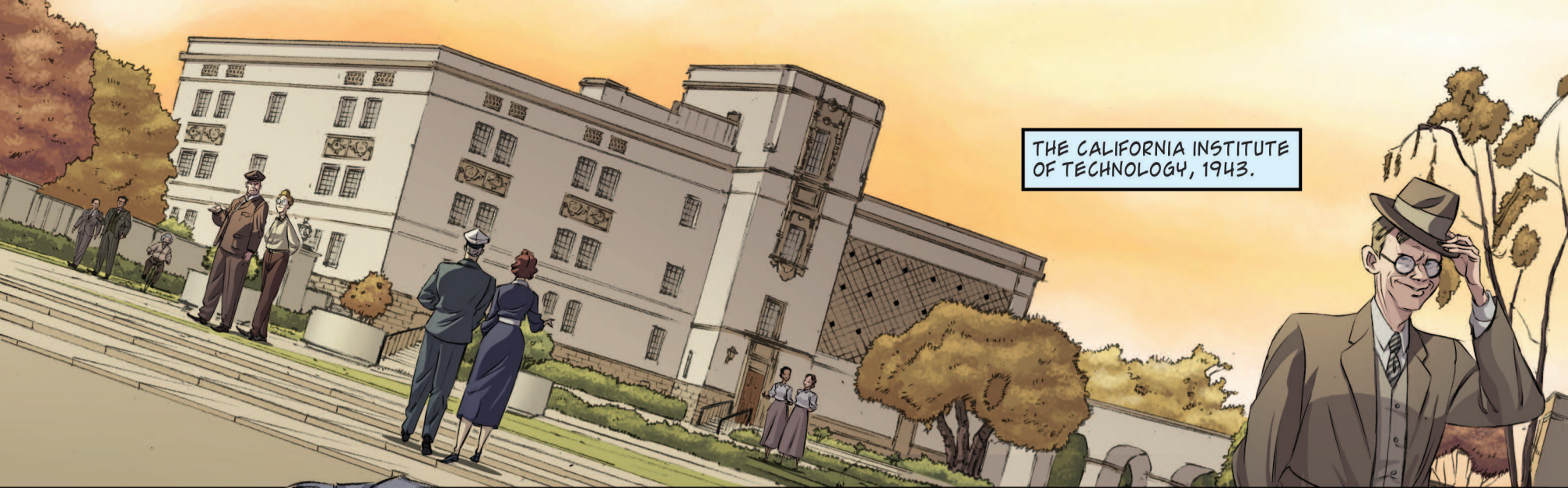
THE CALIFORNIA INSTITUTE OF TECHNOLOGY, 1943.