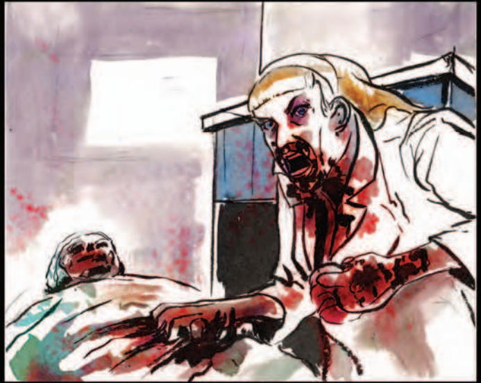
Video surveillance was inadequate at accurately ascertaining the condition of either subject.