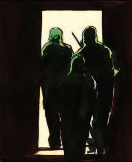
Ms. Baker had attacked an attending nurse during a attempt to draw a blood sample.